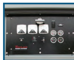
Analog Control Panel