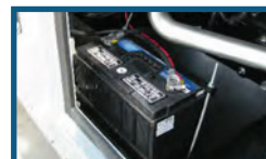
Battery rack, cables and charger