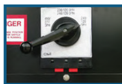
Multi-voltage Selector (Optional)