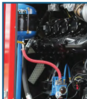
5 to 15 gallon oil reservoir with site glass regulator