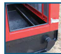
Teardrop Lifting Points extend full frame