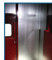
Acoustic insulation with galvanized perf. Liner (Optional)